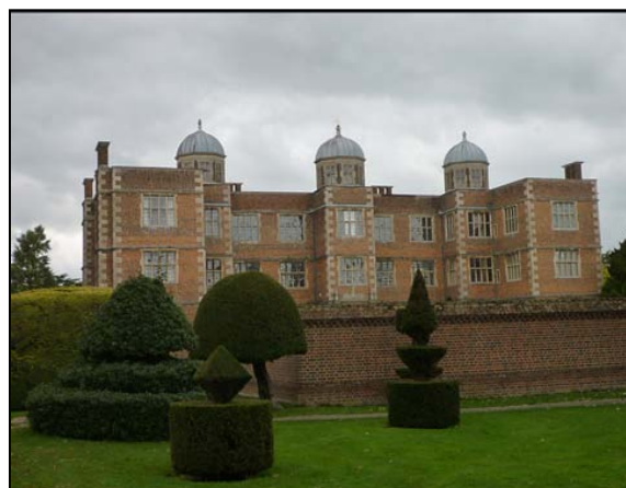
Doddington Hall (see page 2)