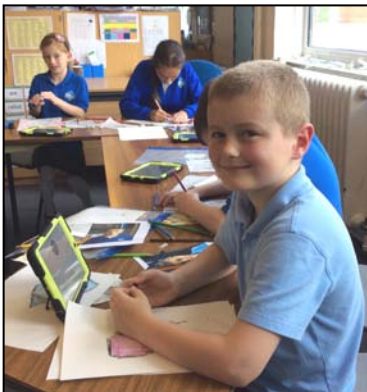
A Geoffrey Field pupil using an iPad to promote confidence in drawing techniques

The latter part of 2015 saw the continuation of the Young Arts programmes in several local schools, including Goring Church of England School, Benson Primary School, Langtree School and the Geoffrey Field Junior School in Reading.