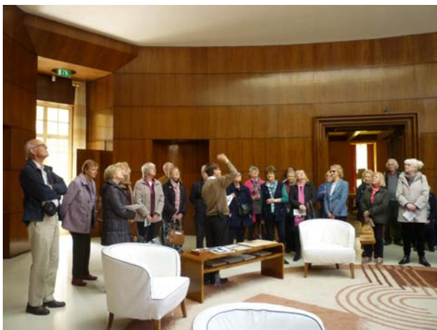
Eltham Palace Visit

I hope you join us and enjoy the company of friends on our day visits – they are lovely social occasions, informative and, I hope, memorable.